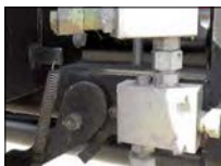
Safety: end of cable/hook upper position automatic movement stop