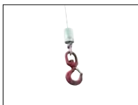
Safety: homologated self locking swivel hook